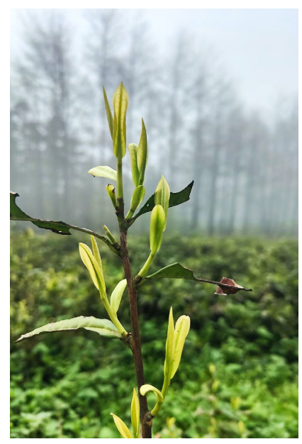
New buds and leaves sprouting in the spring in the organic Mogan tea garden.